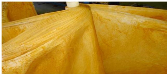
Prevents Iron Fouling