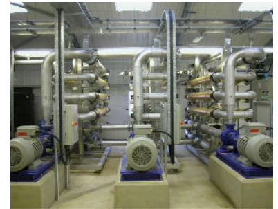
Fig 2: Ultrafiltration (UF) Membrane Installation Each Membrane Module consists of 300 + 8mm tubes with 27m 2 surface area

The RO plant was commissioned in 2004 and has experienced significant membrane fouling, especially during periods of peak production. The results of autopsies on membrane elements and cartridge filters proved that the foulant is mainly organic and microbiological in origin. Aluminosilicates are present as clay and soil from the salad washing process and also calcium phosphate deposits. The feed pressure required to maintain permeate production continually increases due to the build up of foulant on stage 1. The membranes are changed every 18-24 months.