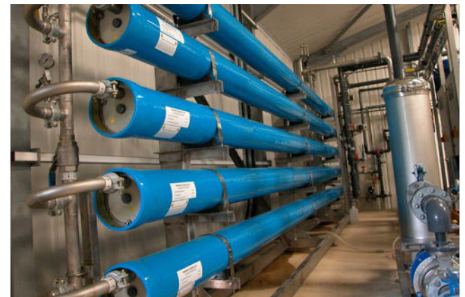
Fig 3: BWRO System