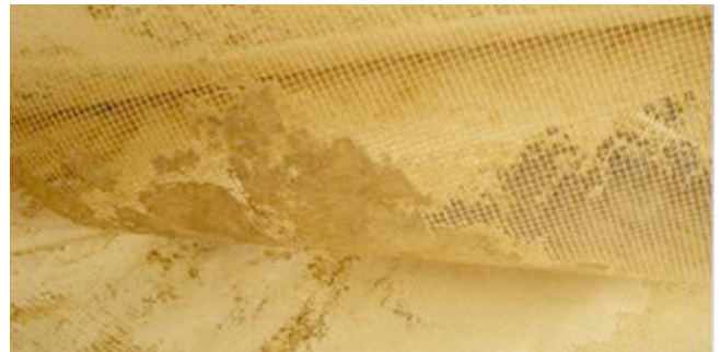
Removes inorganic deposits

Available in 25 kg kegs, 250 kg drums and 1,300 kg IBCs. The shelf life is two years under normal storage conditions.