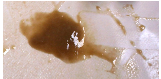
Effectively removes membrane biofilms

Available in 10 kg and 25 kg plastic pails and 1,000 kg bulk bags. Under normal storage conditions the shelf life of Genesol 704 is 1-2 years. Ensure the packaging is sealed after use and the Genesol 704 remains dry.