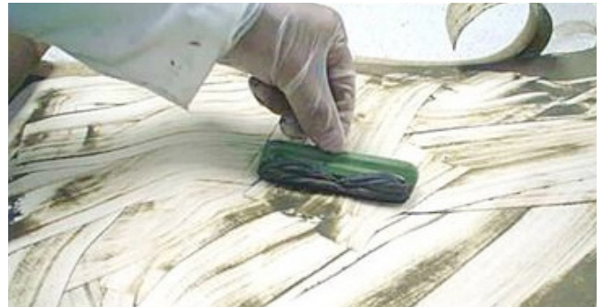
Removes Organic Fouling

The shelf life is two years under normal storage conditions. Ensure the packaging remains well sealed and the Genesol 703 remains dry.