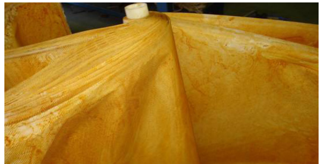
Removes Iron Deposits